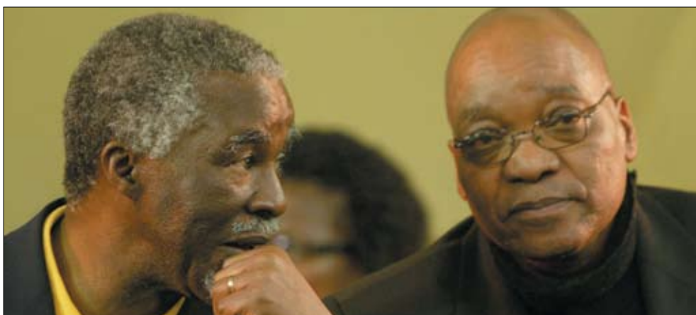
Top: Thabo Mbeki and his deputy, Jacob Zuma, at the cabinet swearing-in ceremony, 29 April 2004.

See Introduction.