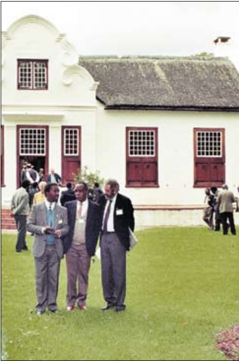
Left: Thabo Mbeki, Joe Nhlanhla and Aziz Pahad at the ANC's preparatory meeting before its first talks with the government, Vergelegen, 29 April 1990. This photograph is on display at Vergelegen Estate, Somerset West. See page 573.