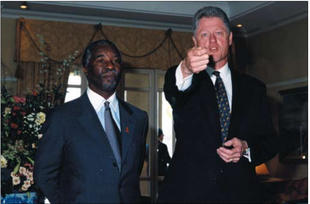
Top: Thabo Mbeki and Bill Clinton at Tuynhuys, Cape Town, 26 March 1998.