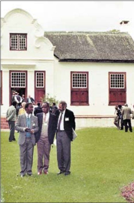
Left: Thabo Mbeki, Joe Nhlhlanhla and Aziz Pahad at the ANC's preparatory meeting before its first talks with the government, Vergelegen, 29 April 1990. This photograph is on display at Vergelegen Estate, Somerset West. See page 573.