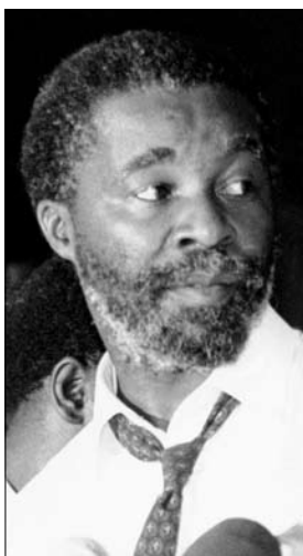
Top left: ‘At one o’clock I was in Lusaka and at three o’clock I was in Cape Town.’ Thabo Mbeki comes home from exile, 28 April 1990, with fellow ANC leaders Ruth Mompati, Joe Slovo, Alfred Nzo and Joe Modise. See page 572.