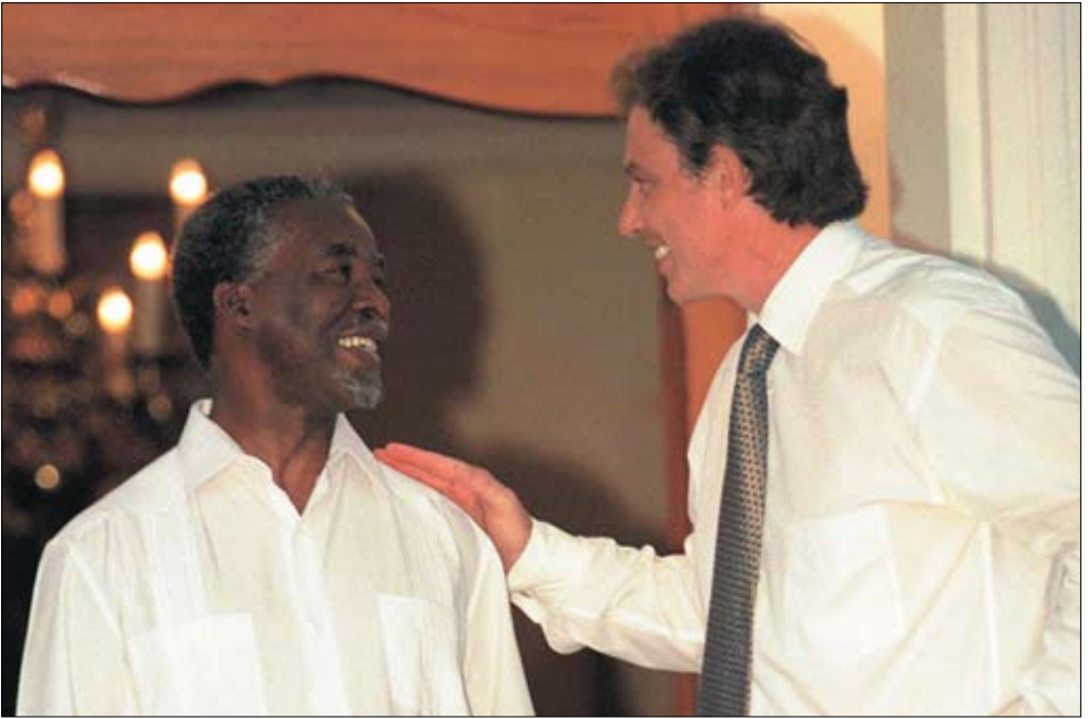
Above: Thabo Mbeki and Tony Blair, Pretoria, January 1999.