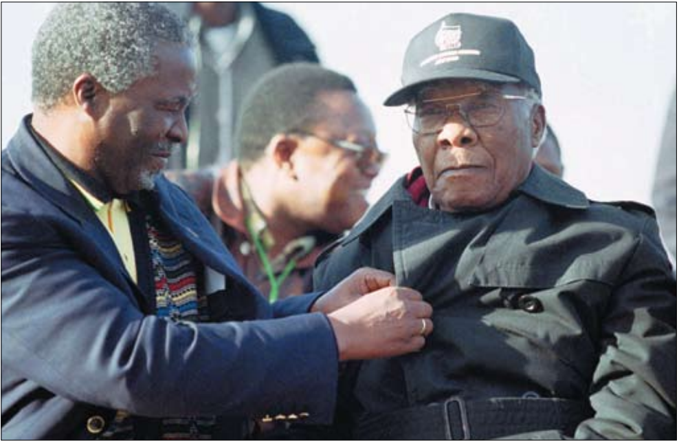
Above: Thabo and Govan Mbeki at a rally in Port Elizabeth, July 2000.