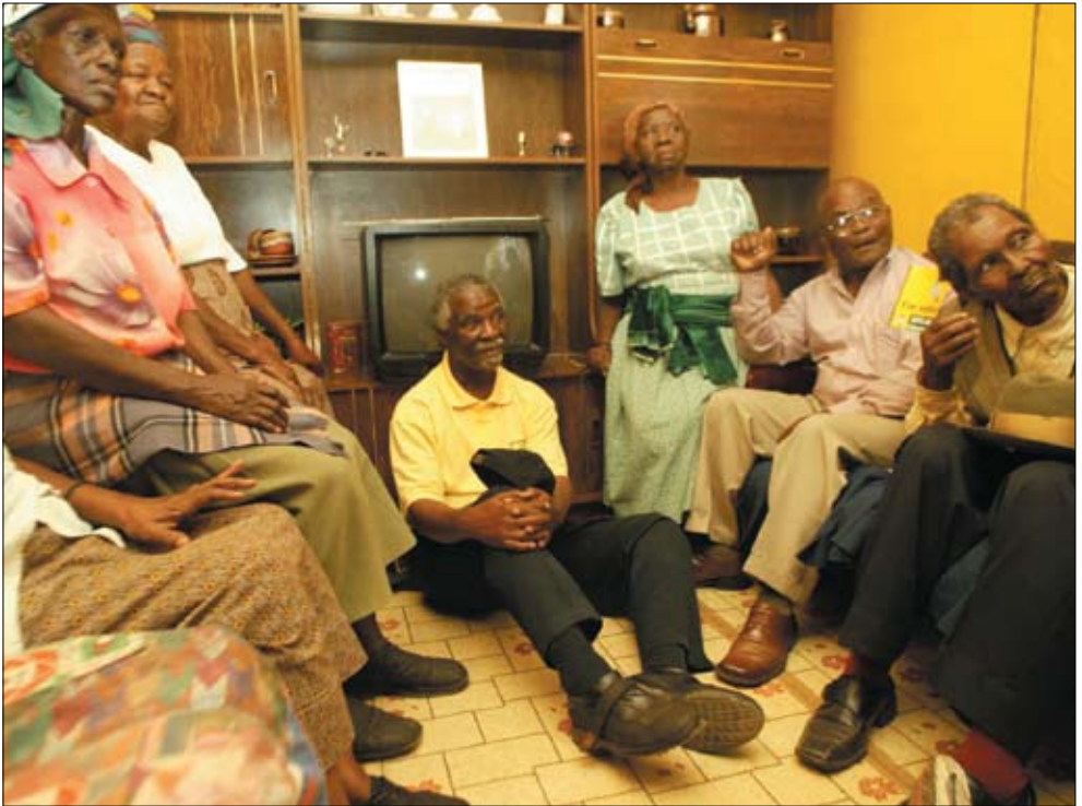
The iconic picture of Thabo Mbeki's 2004 election campaign, when he sat on the floor at a house in Khayamnandi, outside Port Elizabeth, after an elderly man had mistakenly taken the seat reserved for him. See page 775.