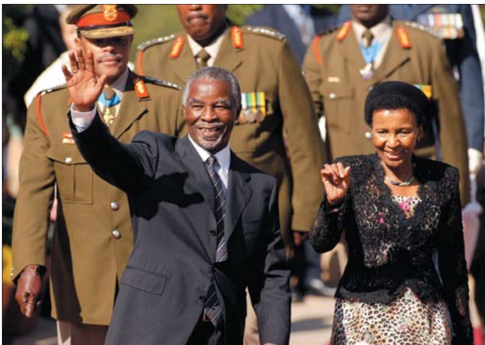
Top: Nelson Mandela and Thabo Mbeki at Mbeki's second inauguration, Union Buildings, Pretoria, 27 April 2004. See Chapter 42.