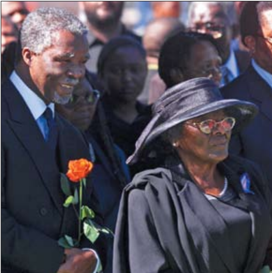
Left: Thabo Mbeki with his mother Epainette at his father Govan's funeral, 8 September 2001. See page 767.