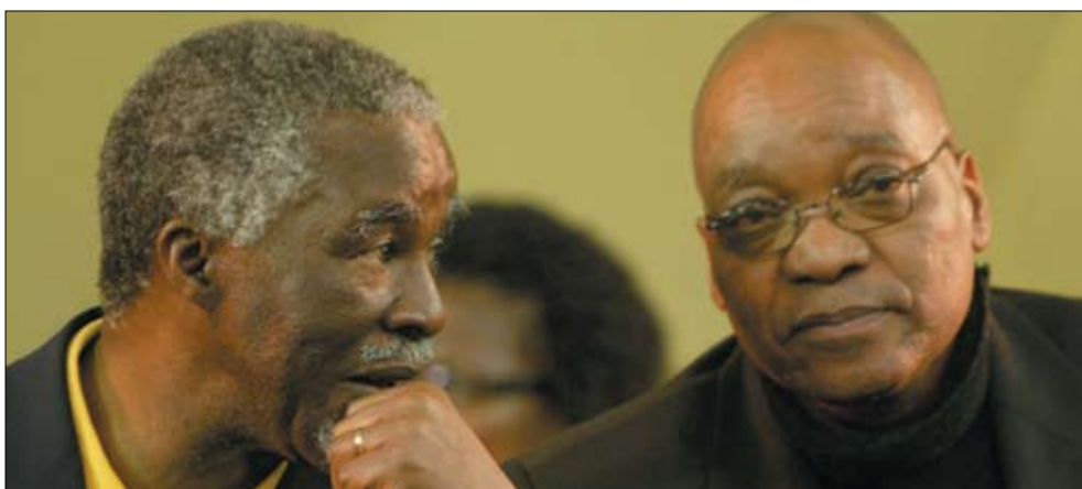
Top: Thabo Mbeki and his deputy, Jacob Zuma, at the cabinet swearing-in ceremony, 29 April 2004. See Introduction.