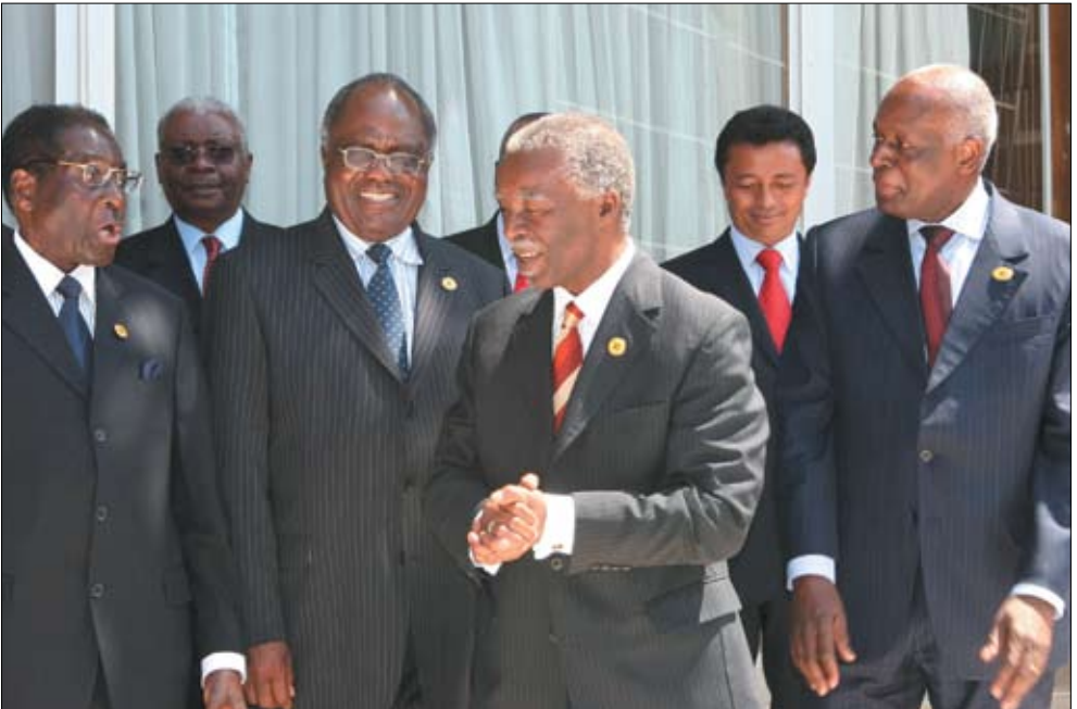
Top: The Bushes and the Mbekis; welcome ceremony at the Union Buildings, Pretoria, 9 July 2003.