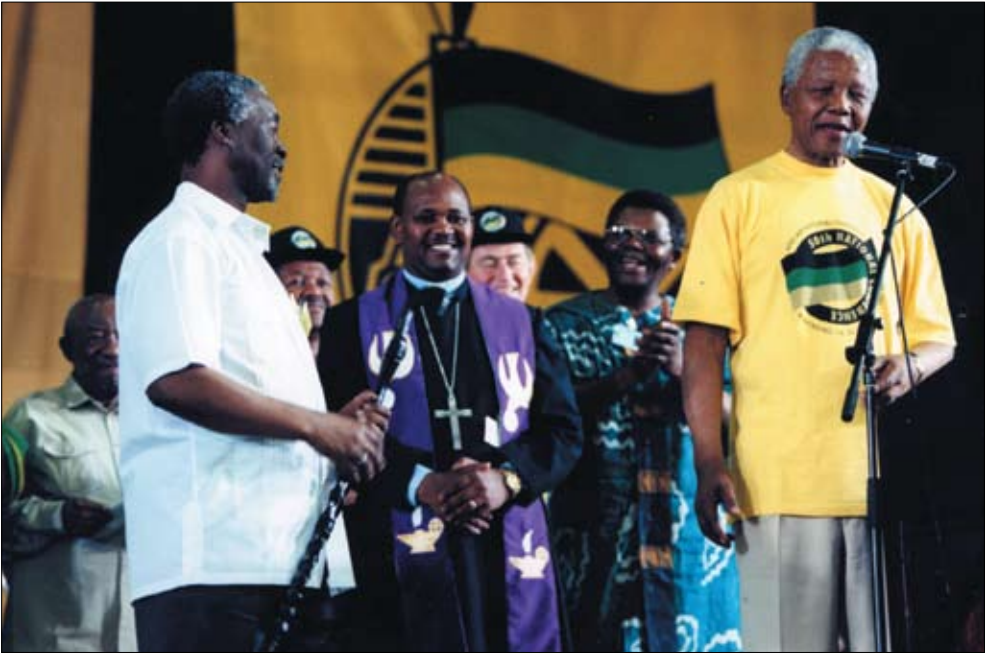
Top: Thabo Mbeki and Nelson Mandela at the ANC National Conference, Mafikeng, December 1997. See page 697.